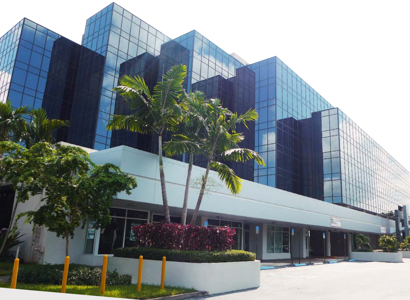
Move-in Ready Speculative Suites